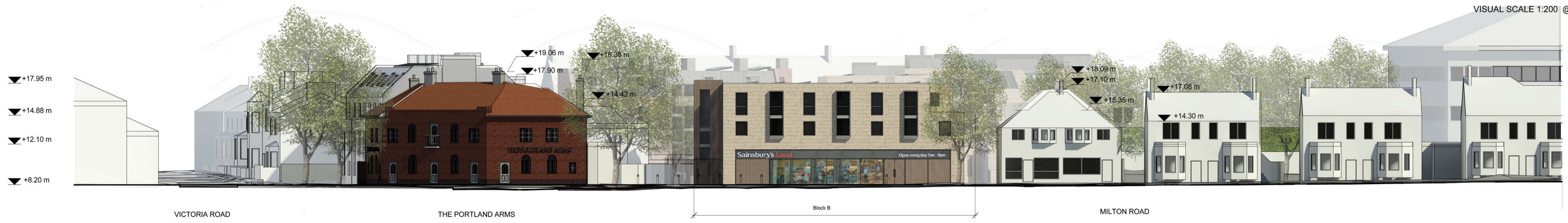
East Elevation_Milton Road